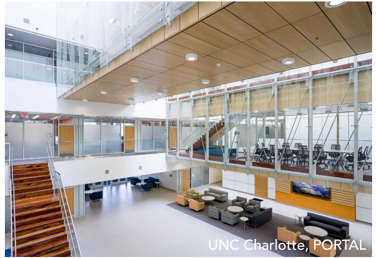
UNC Charlotte, PORTAL