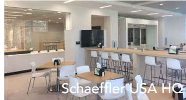
Schaeffler USA HQ