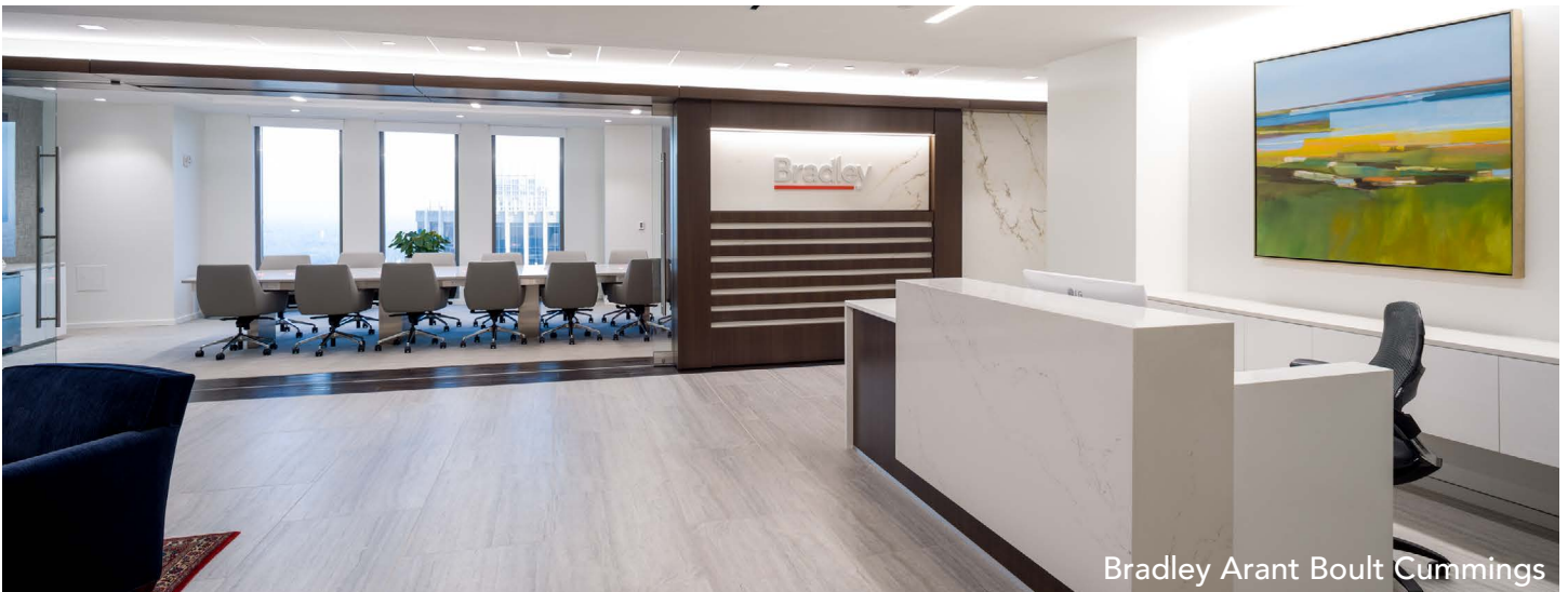
Bradley Arant Boult Cummings

"Edifice, Inc.'s performance on our project was absolutely outstanding. From the guidance and counsel they provided prior to being selected as General Contractor for the project, to their ability to keep costs in line, to the build-out and beyond, they have been trusted advisors and partners. The level of ownership they took with our project exceeded our expectations. Our project presented two significant challenges: a very compressed time frame and facility regulations requiring all work be performed after-hours. The team at Edifice did a great job managing those challenges and always presented effective solutions proactively. If we were to tackle this project ten more times, we would select Edifice, Inc. every time.